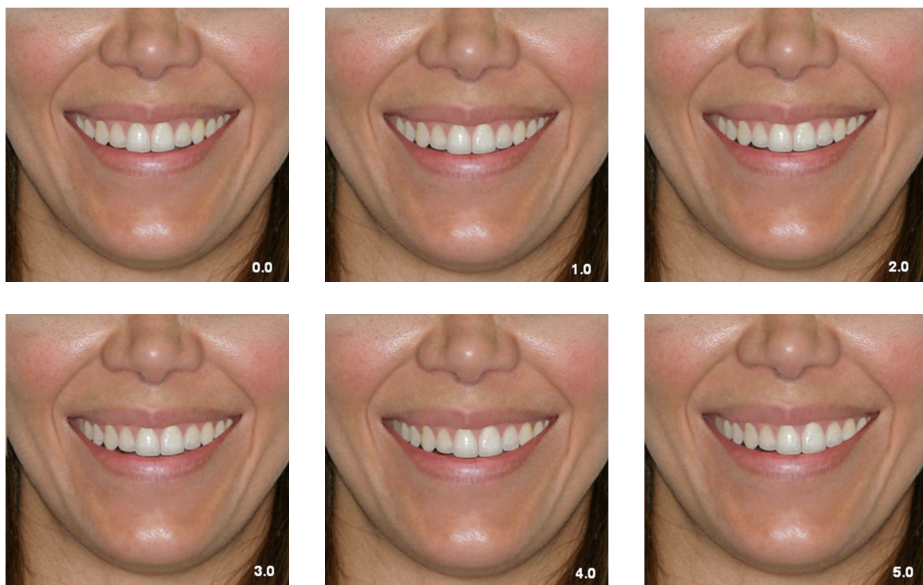
Figure 1 - Group LCN photographs: the numbers on the photographs indicate the amount of deviation in millimeters.