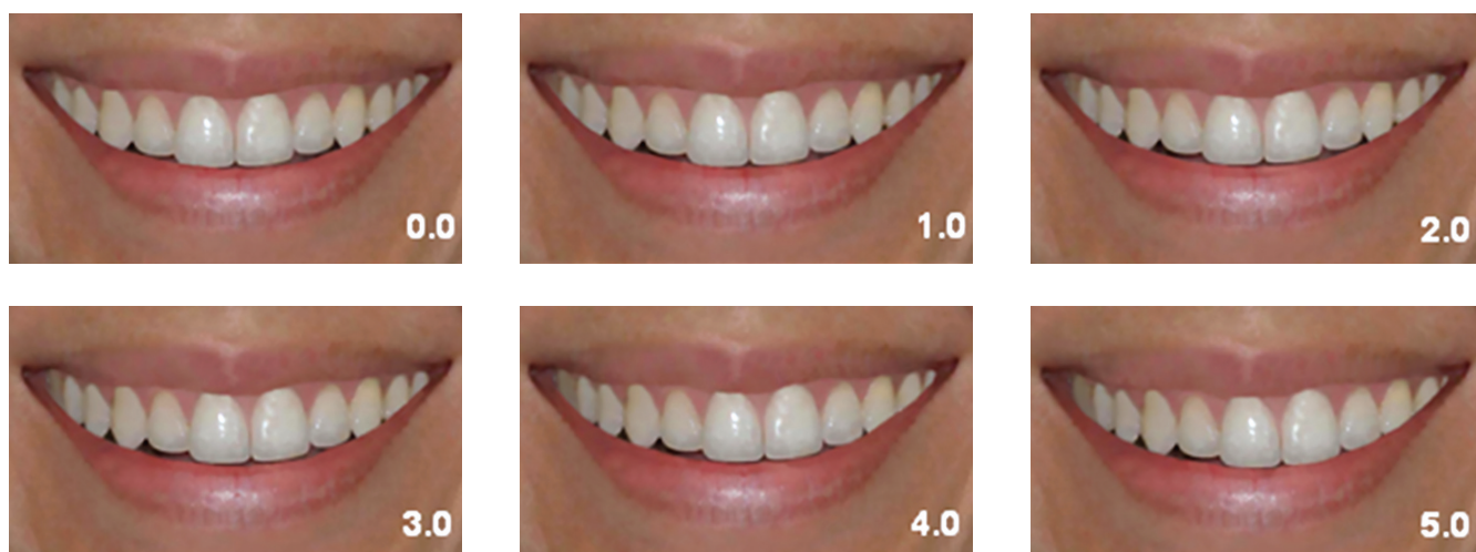
Figure 2 - Group L photographs: the numbers on the photographs indicate the amount of deviation in millimeters.