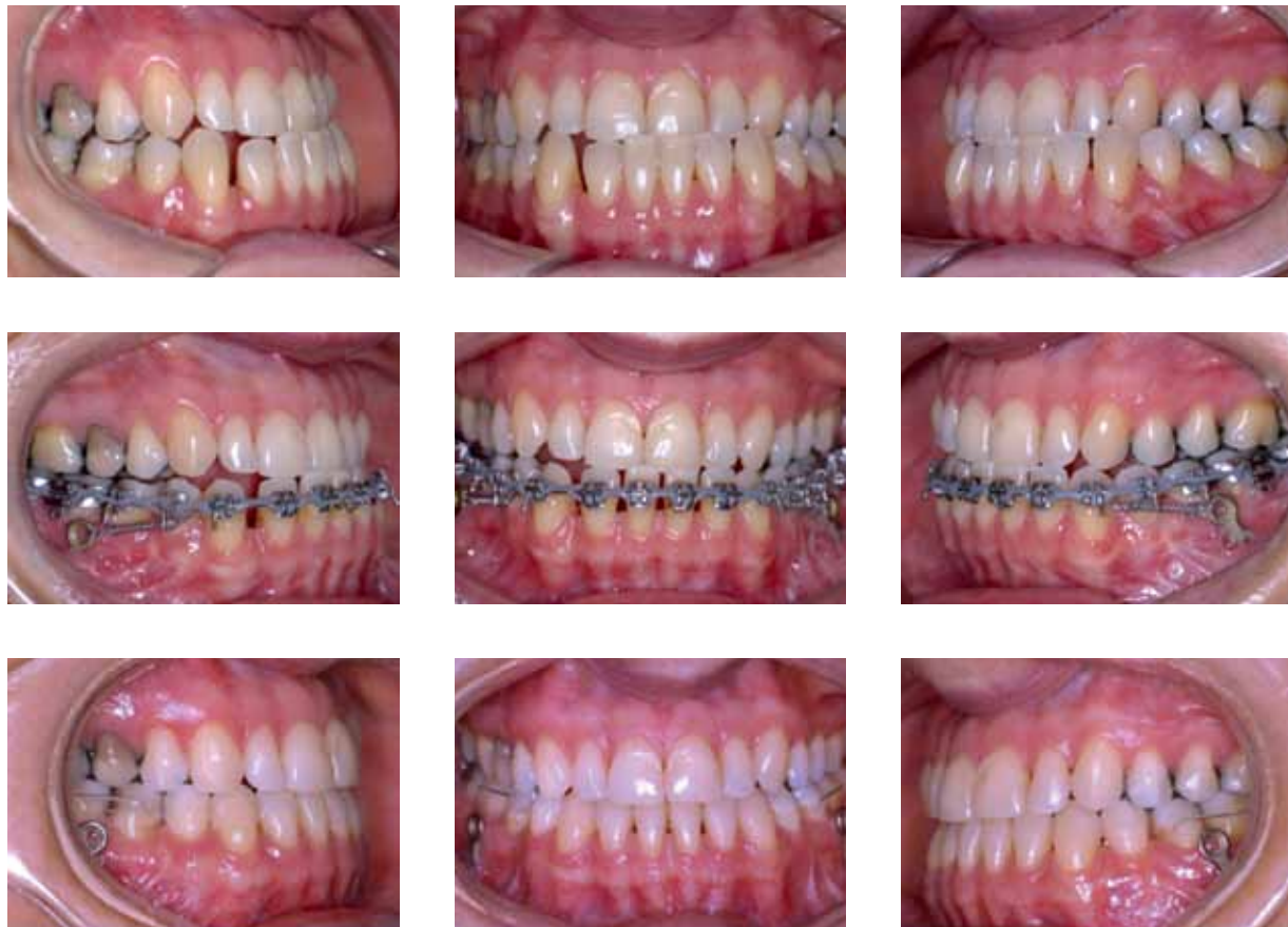
FIGURE 1 - The titanium miniplates may be used in the jaw to serve as anchors for retraction of all the lower teeth. With this, you can avoid the orthognathic surgery in patients who do not wish to submit to it. The experience with this type of treatment gave me conditions to plan the orthodontic treatment as a whole before the surgery, then, install the appliance and operate without the conventional preparation for orthognathic surgery. Avoiding the conventional preparation does not mean not preparing the case for surgery. In fact, we have with the Anticipated Benefit more involvement with the "preparation" for treatment planning.

The patient was bearer of a dentofacial deformity with a Pattern II. So, he would need lower incisor retraction prior to surgery to increase the overjet and enable mandibular advancement. During the appointment itself, I thought about my experience with Class III compensation with retraction of all lower teeth (Fig 1). In this treatment modality, we can take the lower teeth, that are already in a com-